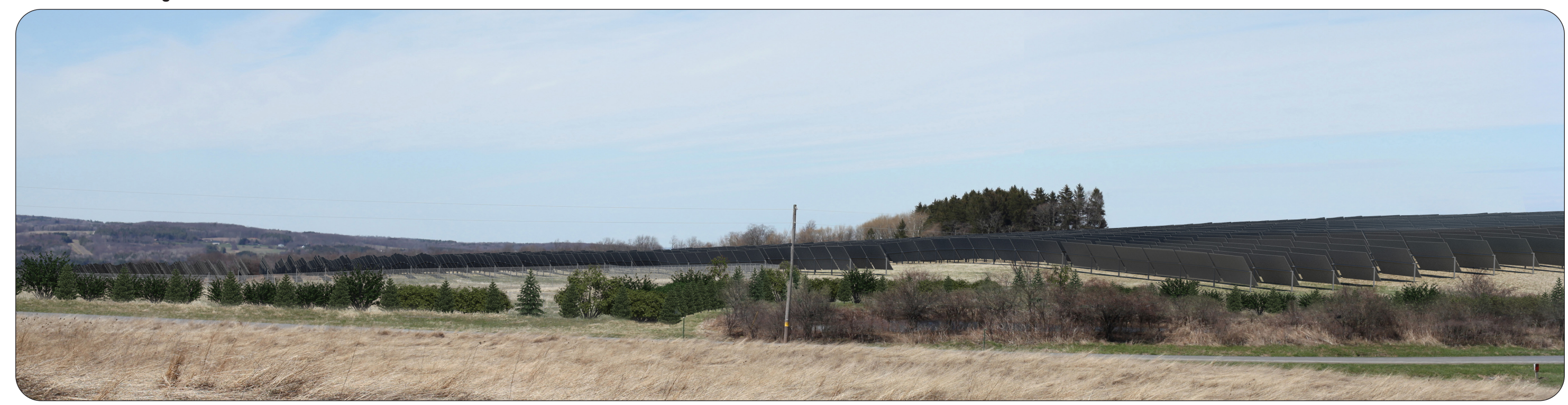
Simulation - Mitigation at 5 Years - Leaf Off